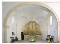
Photo: The altar of the church in Dobrá Voda