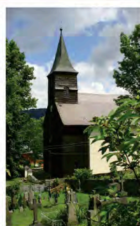
Photo: The church in Hojsova Stráž