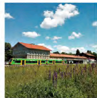
Photo: The building of the museum of the Nature Park Welten

The railway station building of 1877 is, accurately in its midpoint, divided by state border and it currently serves as the information centre of the Nature Park of the Bavarian Forest and the National Park of the Šumava Mountains and the Bavarian Forest. Its part is also a museum with interactive elements of the Nature Park of the Bavarian Forest focused on the topics, such as life of bats, Gr. Arber, the history of skiing and cross-country skiing (with a skiing simulator), building the railway, on the highest floor a railway model with its surface of 260 m 2 is being finished. The part of it is also a lecture theatre, a cinema