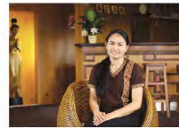
Photo: Thai massages