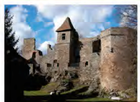
Photo: The Klenová Castle and Chateau

The ruins of a Gothic castle of the middle of the 13th century. In the 19th century a chateau, in the spirit of romantism, decorated in the New Gothic style, was added in the part of the south Bailey. Since 1963 an art gallery, the Gallery Klatovy/Klenová, has been established here. www.gkk.cz, +420 376 392 208