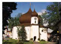
Photo: The church of Virgin Mary Helpful from the Star