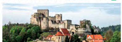
Photo: The Rabí Castle

sight of a Gothic architecture upon the Otava River. www.hrad-rabi.eu, +420 376 596 171