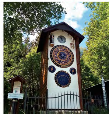
Photo: The astronomical clock of the Šumava Mountains