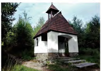
Photo: St. Anne's Chapel near the Way of Cross