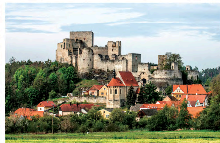
Photo: The Rabí Castle