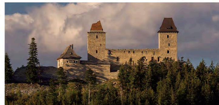
Photo: The Kašperk Castle