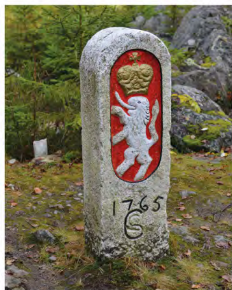
Foto: Border stone