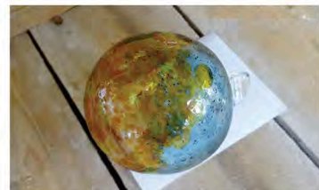
Photo: The glass factory Annín