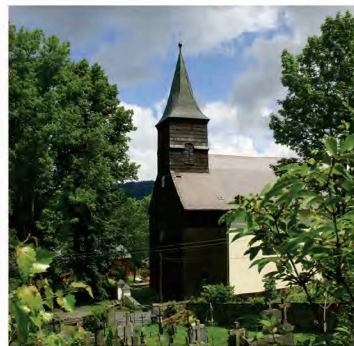
Photo: The Church of Immaculate Conception of Virgin Mary in Hojsova Stráž

Stráž. The association organizes a huge amount of cultural events, such as regular summer concerts and singing carols on Christmas Eve. In the church comentated tours for individual visitors and groups take place – visitors can get the information in the Information and Environmental Centre in the town of Železná Ruda.