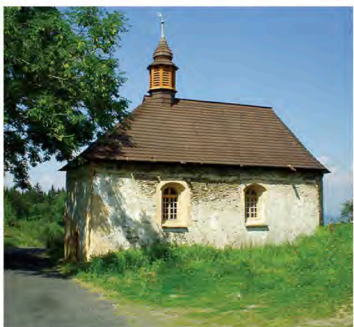
Photo: The Chapel of St. Kunhuta