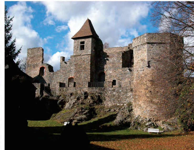
The Klenová Castle and Chateau