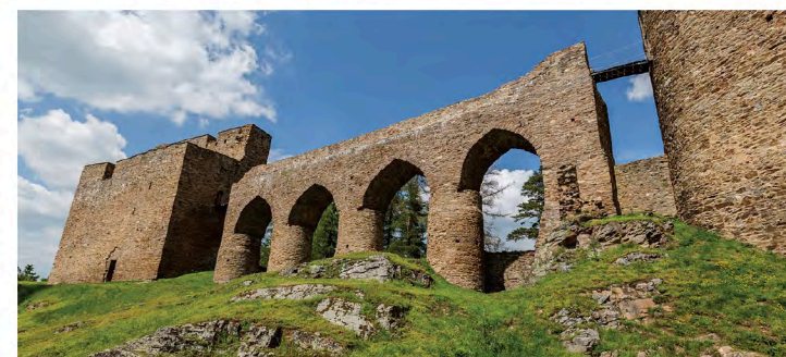
Photo: The Velhartice Castle and Chateau